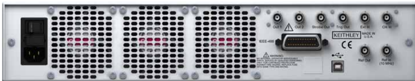
Model 3402-R, Dual-Channel with Rear Outputs